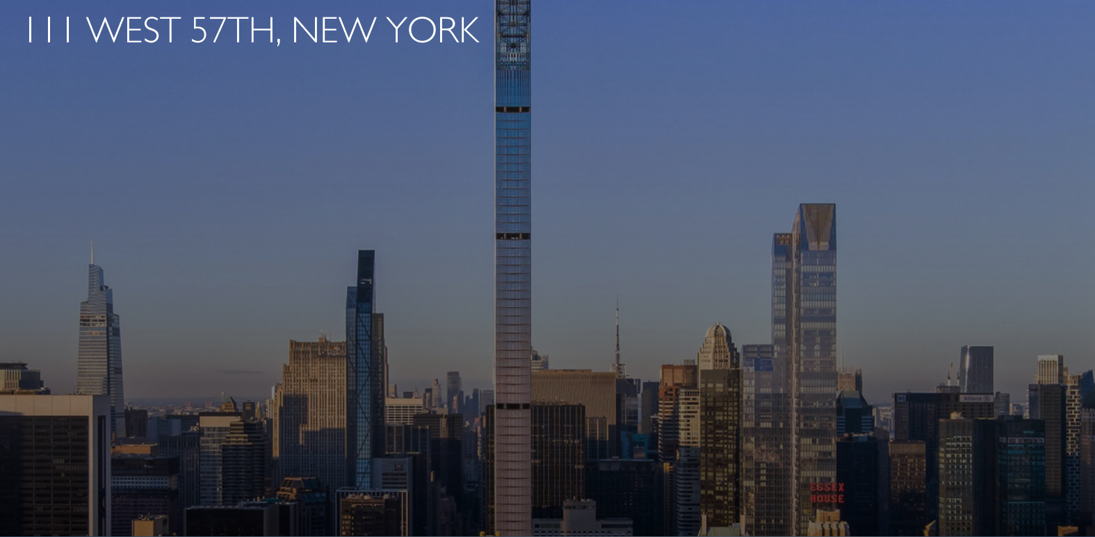
111 WEST 57TH, NEW YORK