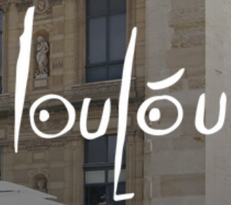
5 Hertford Street, London