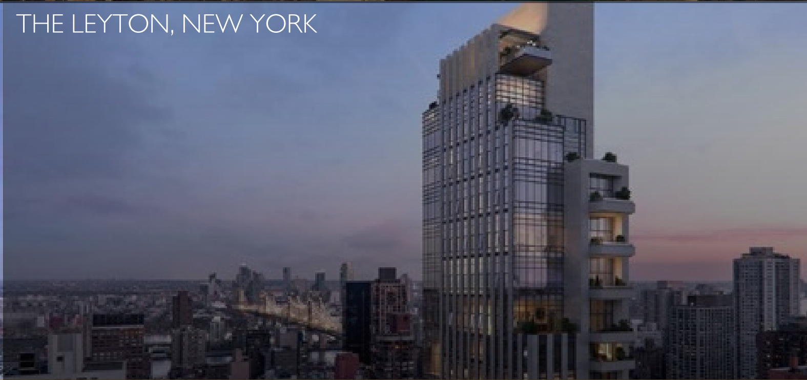
THE LEYTON, NEW YORK