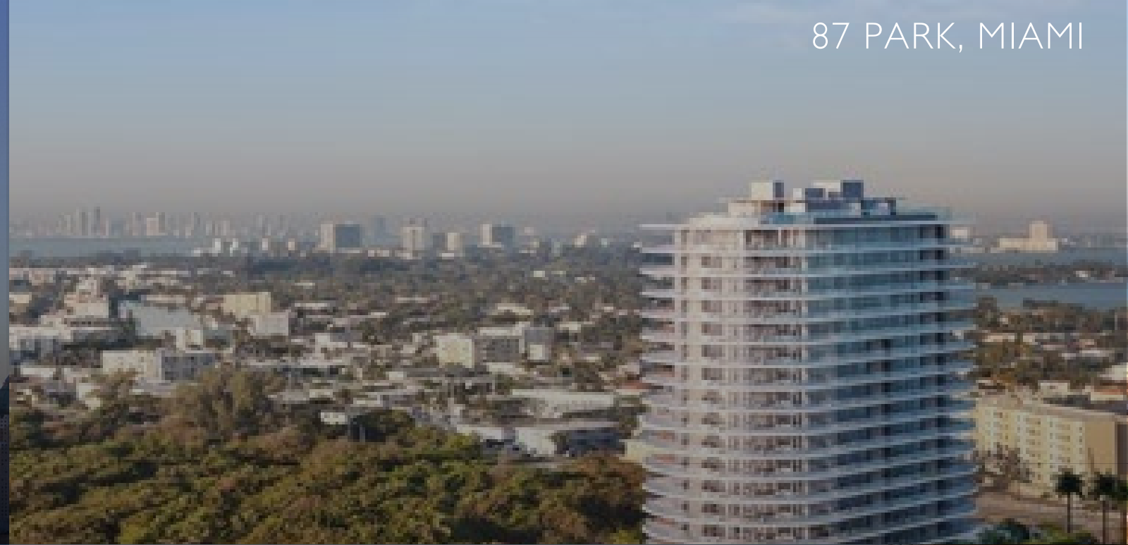
87 PARK, MIAMI